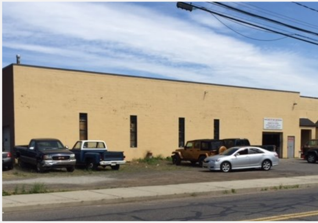
Present use Commercial Garage With Used Car License Dealer